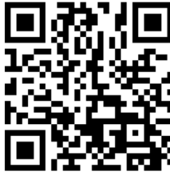
7TQ7 - Update