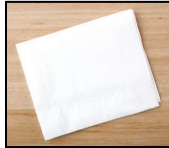
ICS 201 MN

Point is a 201 can be written on a McDonald's napkin if need be.